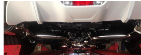
Diff Pipes and mufflers from Behind