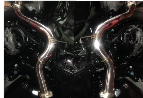
Left and Right Diff Pipes

Make sure all gaskets are in and bolts at this stage are finger tight only.