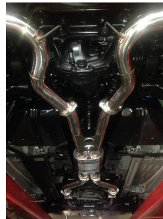
How the exhaust should look once everything is fitted