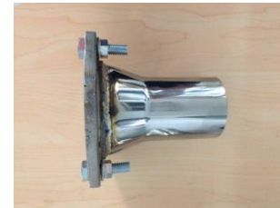
Factory Cat Back Adapter

Make sure all gaskets are in (and have O2 sensor safe gasket glue) and all bolts at this stage are finger tight only.